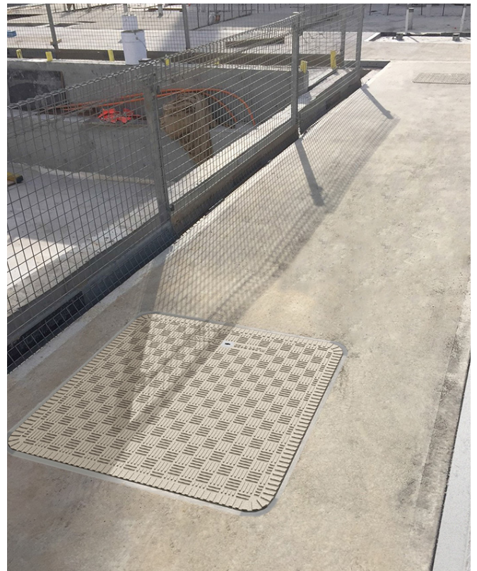
Installed cover over balance tanks

Fibrelite's standalone covers proved the perfect solution. Composite covers are chemically inert, so have no reaction to either water or chlorine, meaning that the covers will remain watertight and safe to walk on year on year. They are also lightweight, so can be safely and quickly removed by one person using the ergonomically designed FL7A lifting handle. Fibrelite provided a custom coloured solution to blend in with the surroundings. The patented monolithic structure of the covers means that they will not crack or delaminate or fade, as tested by BSI.