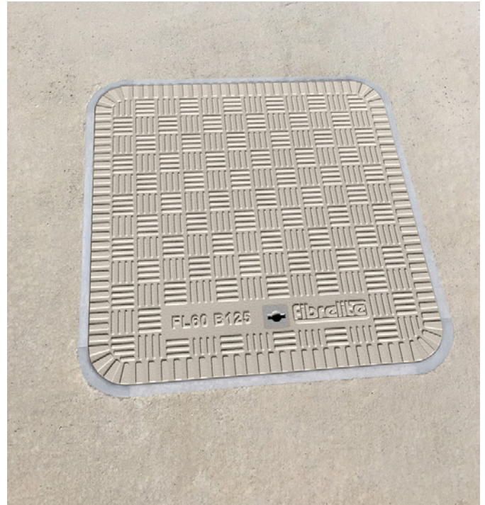
Bespoke coloured cover to match floor