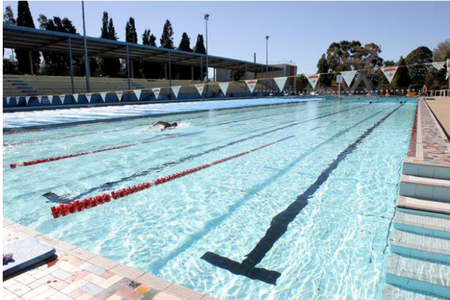
Leisure centre redevelopment Auburn, Sydney