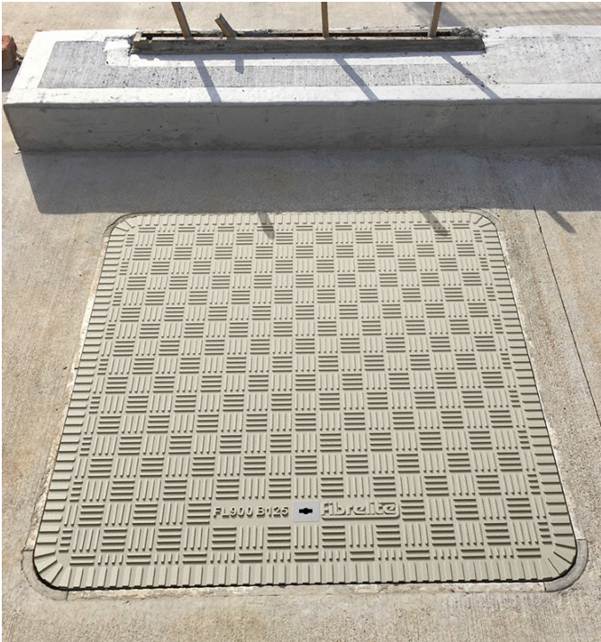
Watertight FL900 B125 cover