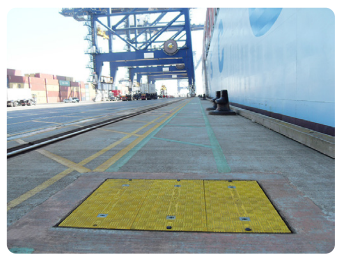
The Fibrelite 90 tonne load rated lightweight trench covers in position on the auavside

Fibrelite was tasked with providing a retro-fit 90 tonne load rated lightweight cover that could withstand the rigours and working environment of an extremely busy commercial port.