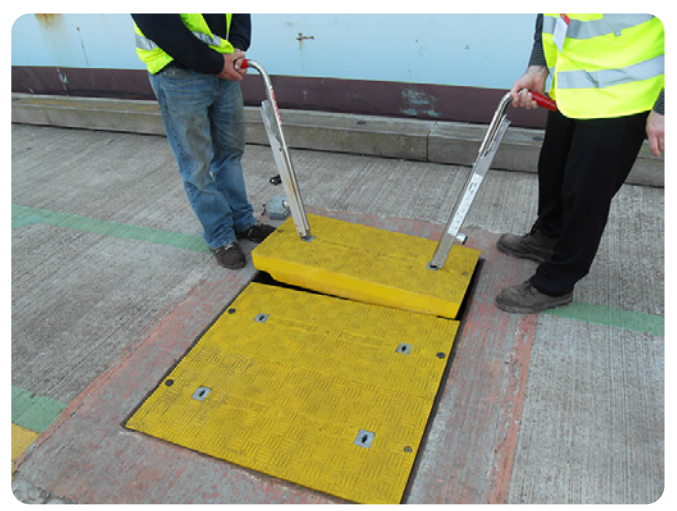
Simple and safe removal using the Fibrelite lifting handles

The replacement covers that Fibrelite supplied were load rated to F900 and colour coded yellow to denote fresh drinking water supply. The regional water authority had previously specified that the covers must be secured to prevent unauthorised access so Fibrelite provided a bolt down version so that the trench covers could be secured to the existing frame.