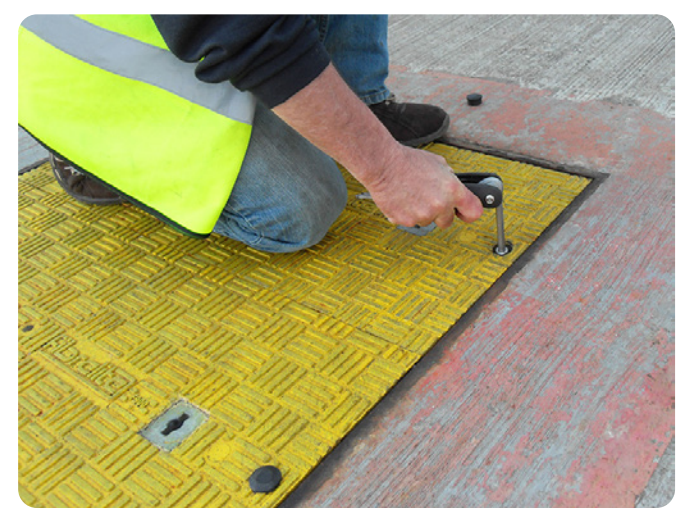
Operator removing the Fibrelite securing system