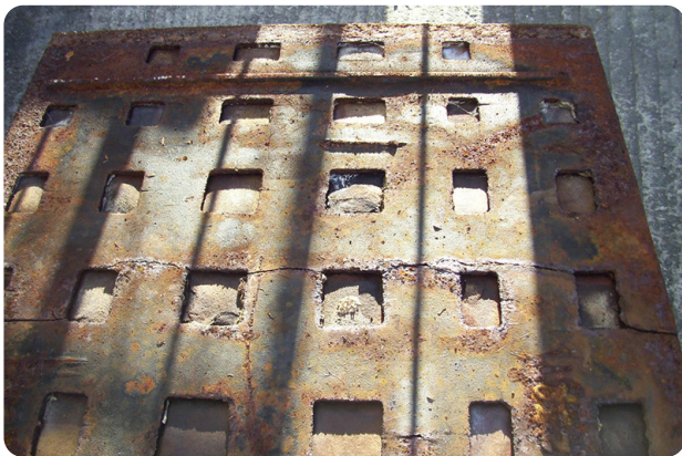
The previously installed old corroding and crumbling concrete covers