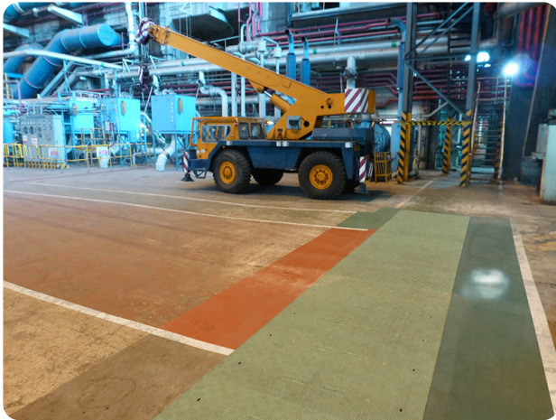
Large Span: Fibrelite trench covers go up to 1600mm in length at D400 (40 tonne) load rating

The second phase installation has been completed as Fibrelite supply 7.65m of 1350mm long trench access covers in D400 load rating. Covers have now been installed in the entrance of the boiler room where HGV's are frequently entering and exiting through the roller doors. The critical requirement was that the covers could withstand the imposed loading from the HGV's.