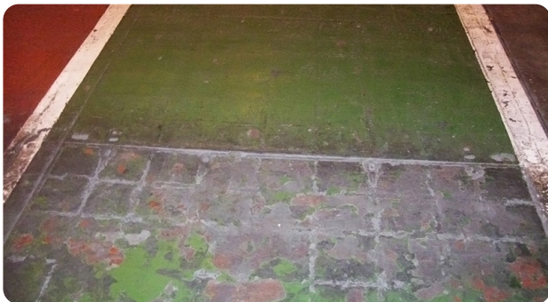
Once removed the concrete covers would never sit back in the frame correctly

This particular client required the covers to match the already coloured floor and Fibrelite was able to match exactly to the pale green colour.